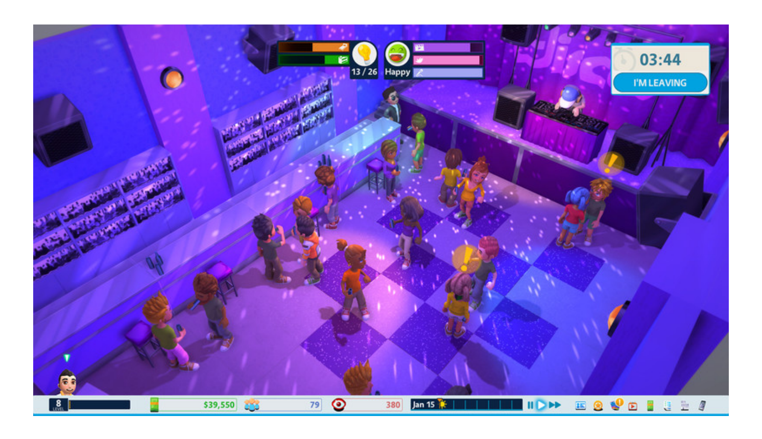
Youtubers Life Download Thepcgames

Download ->>->> <a href="http://bit.ly/2SIpQtv">http://bit.ly/2SIpQtv</a>